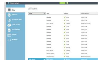
Virtual Active Directory