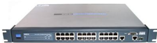
Upgraded Network Infrastructure