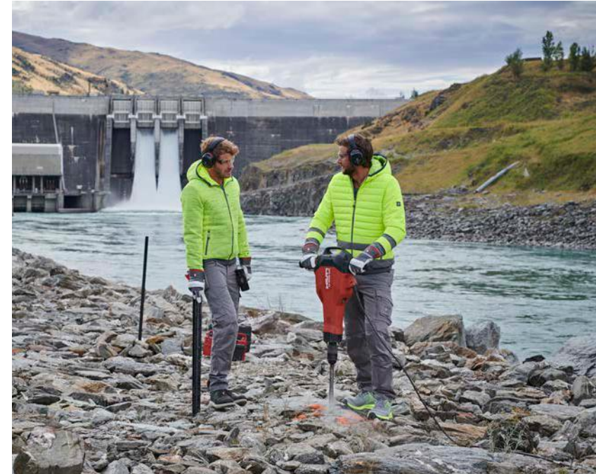
Engelbert-Strauss produces high-tech workwear, safety footwear and personal protective equipment designed in Germany

“A particular advantage of the LogPoint solution is the licensing model. Based on the number of nodes rather than data volume, it’s a good model for us as IT administrators. It’s very easy to calculate the price you are going to pay, as you always know the number of nodes. In that way you can start out small and expand the coverage as you go along, and you can keep the finance department happy,” he says.