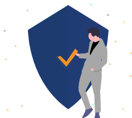
Safe and secure

They firmly believed in investing in their systems and IT infrastructure to deliver modern services and provide streamlined processes for their donors and supporters.